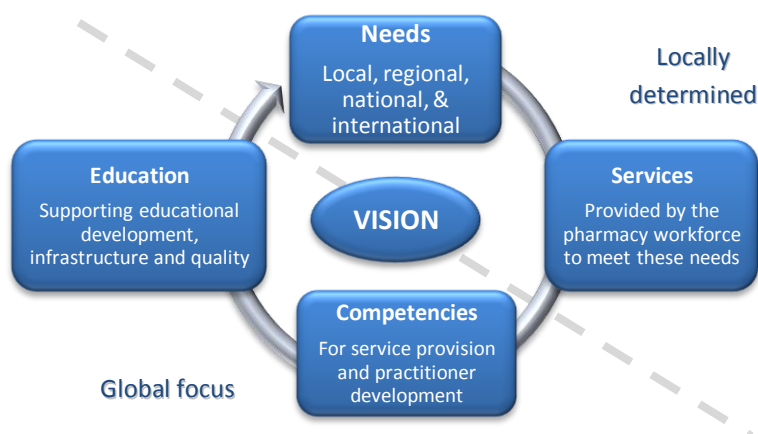
Figure 2 – The needs-based education development cycle.

The PET was established in November 2007 with the endorsement of FIP Executive to undertake a collaborative tripartite programme of work (with our UNESCO and WHO partners) formulated in the Pharmacy Education Action Plan 2008 – 2010 19 . The aims of the Action Plan are to support wider efforts to catalyse country level responses to the pharmacy workforce crisis, provide evidence-based guidance and frameworks to facilitate pharmacy education development and capacity to enable the sustainability of a pharmacy workforce relevant to the country needs (Figure 2). This work was conducted using a needs-based approach to education development.